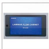
7-inch Color Touch Screen Airflow Level